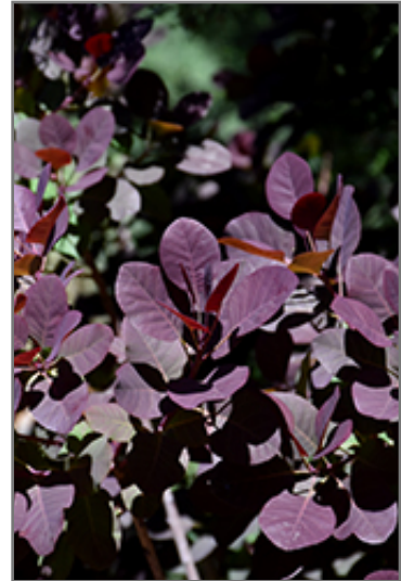
Lilla Smokebush foliage

This shrub should only be grown in full sunlight. It is very adaptable to both dry and moist locations, and should do just fine under average home landscape conditions. It is not particular as to soil type or pH. It is highly tolerant of urban pollution and will even thrive in inner city environments, and will benefit from being planted in a relatively sheltered location. This is a selected variety of a species not originally from North America.