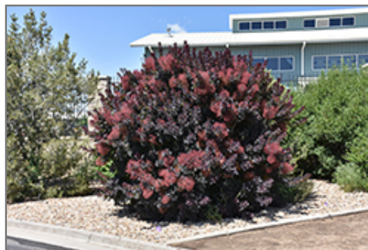
Lilla Smokebush in bloom

Lilla Smokebush is recommended for the following landscape applications;