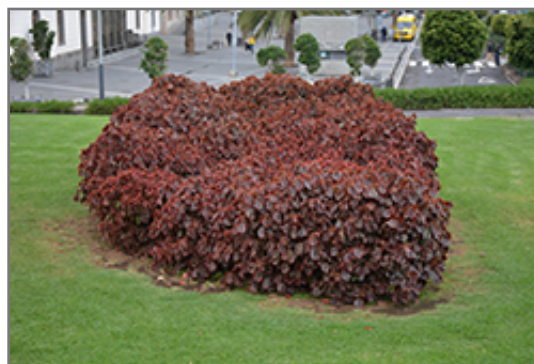
Obovata Copperleaf