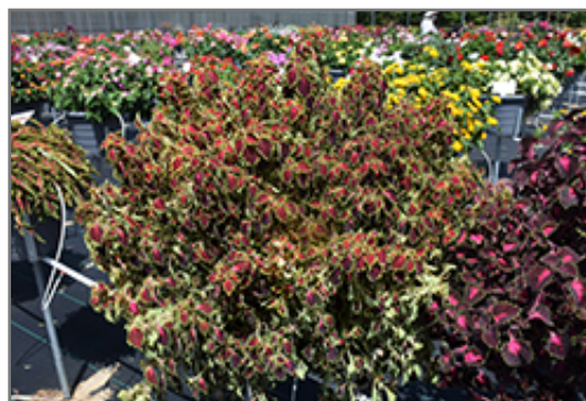
TrailBlazer Glory Road Coleus