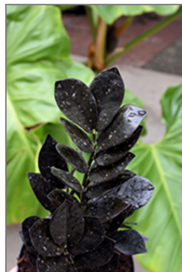
Raven ZZ Plant flowers