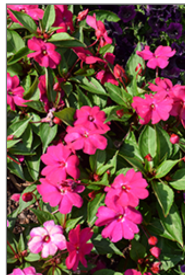
Solarscape Magenta Bliss Impatiens flowers

Solarscape Magenta Bliss Impatiens is recommended for the following landscape applications;