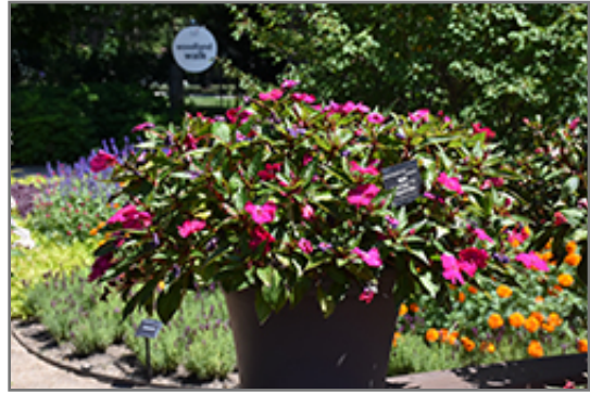
Solarscape Magenta Bliss Impatiens in bloom

Solarscape Magenta Bliss Impatiens will grow to be about 9 inches tall at maturity, with a spread of 20 inches. When grown in masses or used as a bedding plant, individual plants should be spaced approximately 14 inches apart. Its foliage tends to remain low and dense right to the ground. This fast-growing annual will normally live for one full growing season, needing replacement the following year.