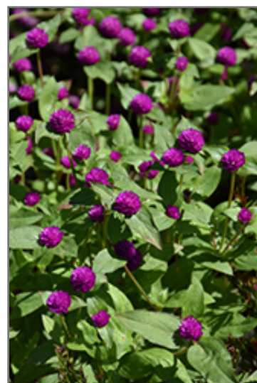
Pinball Purple Globe Amaranth flowers