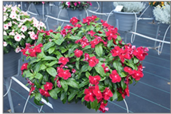
Titan Cranberry Vinca in bloom

Titan Cranberry Vinca will grow to be about 14 inches tall at maturity, with a spread of 12 inches. Its foliage tends to remain dense right to the ground, not requiring facer plants in front. Although it's not a true annual, this fast-growing plant can be expected to behave as an annual in our climate if left outdoors over the winter, usually needing replacement the following year. As such, gardeners should take into consideration that it will perform differently than it would in its native habitat.