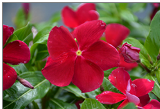
Titan Cranberry Vinca flowers