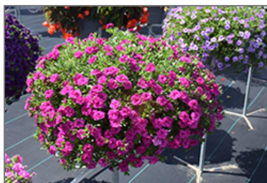
MiniFamous Neo Double Purple Calibrachoa in bloom