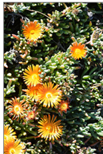
Orange Glow Orange Ice Plant flowers

Orange Glow Orange Ice Plant is recommended for the following landscape applications;