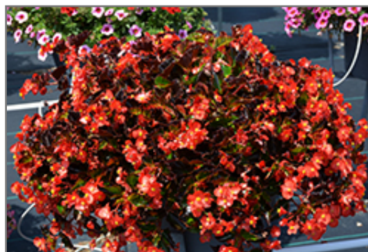
Hula Red Begonia in bloom