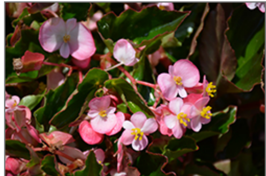
Hula Pink Begonia flowers

This is a high maintenance plant that will require regular care and upkeep, and usually looks its best without pruning, although it will tolerate pruning. Deer don't particularly care for this plant and will usually leave it alone in favor of tastier treats. Gardeners should be aware of the following characteristic(s) that may warrant special consideration;