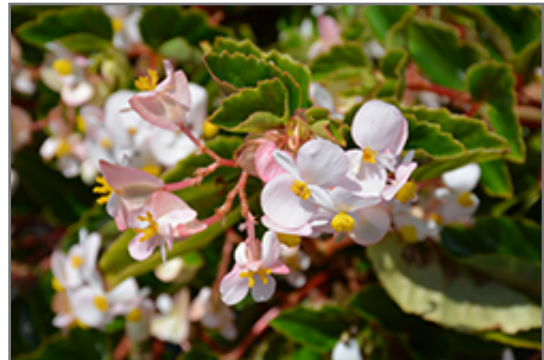
Hula Blush Begonia flowers