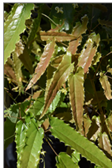
Spine Tingler Barrenwort foliage