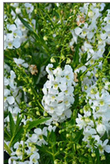
Angelwings White Angelonia flowers

Angelwings White Angelonia is recommended for the following landscape applications;