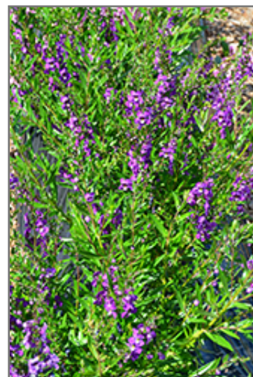
Angelwings Dark Blue Angelonia in bloom