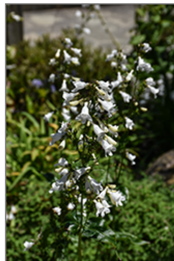
Foxglove Beardtongue flowers