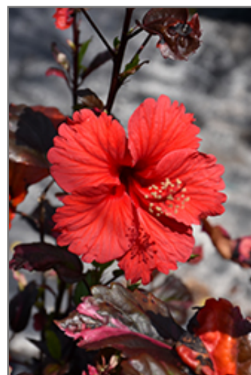
Fire and Ice Hibiscus flowers

This plant does best in full sun to partial shade. It requires an evenly moist well-drained soil for optimal growth, but will die in standing water. This plant is a heavy feeder that requires frequent fertilizing throughout the growing season to perform at its best. It is not particular as to soil pH, but grows best in rich soils. It is highly tolerant of urban pollution and will even thrive in inner city environments. Consider applying a thick mulch around the root zone in winter to protect it in exposed locations or colder microclimates. This is a selected variety of a species not originally from North America. It can be propagated by cuttings; however, as a cultivated variety, be aware that it may be subject to certain restrictions or prohibitions on propagation.