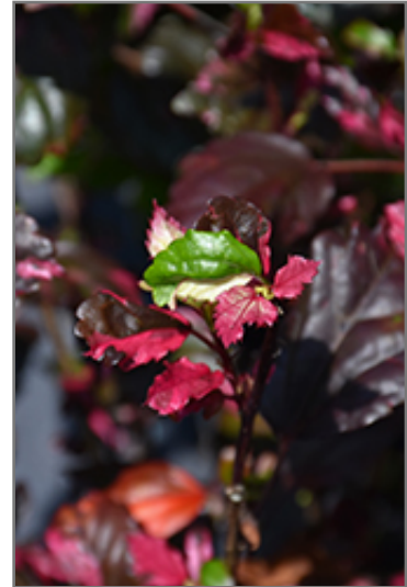
Fire and Ice Hibiscus foliage

-- THIS IS A TROPICAL PLANT AND SHOULD NOT BE EXPECTED TO SURVIVE THE WINTER OUTDOORS IN OUR CLIMATE --