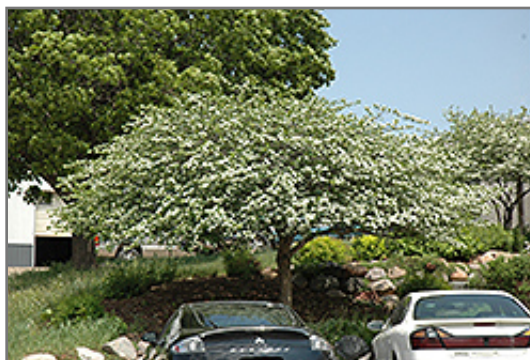
Thornless Cockspur Hawthorn in bloom

Thornless Cockspur Hawthorn will grow to be about 25 feet tall at maturity, with a spread of 25 feet. It has a low canopy with a typical clearance of 3 feet from the ground, and is suitable for planting under power lines. It grows at a slow rate, and under ideal conditions can be expected to live for 50 years or more.