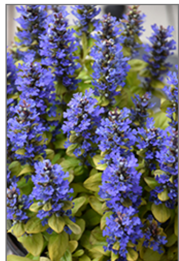
Feathered Friends Petite Parakeet Bugleweed flowers