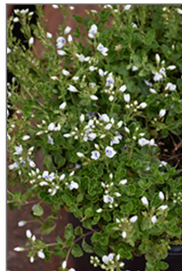
Snowmass Blue-Eyed Veronica flowers

Snowmass Blue-Eyed Veronica is recommended for the following landscape applications;