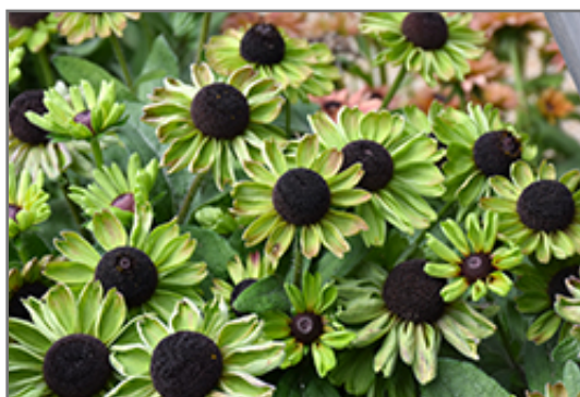
August Forest Coneflower flowers