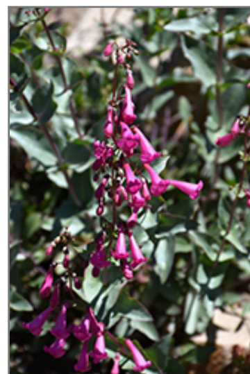
Sunset Crater Penstemon flowers

Sunset Crater Penstemon is recommended for the following landscape applications;