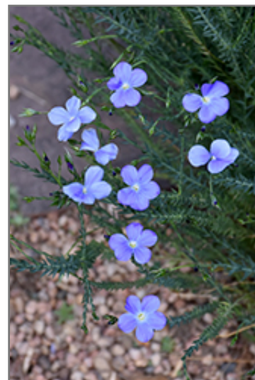
Narbonne Blue Flax flowers

Narbonne Blue Flax is recommended for the following landscape applications;