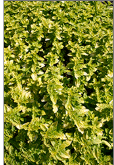
Drops of Jupiter Oregano foliage

Drops of Jupiter Oregano is a fine choice for the garden, but it is also a good selection for planting in outdoor pots and containers. It can be used either as 'filler' or as a 'thriller' in the 'spiller-thriller-filler' container combination, depending on the height and form of the other plants used in the container planting. It is even sizeable enough that it can be grown alone in a suitable container. Note that when growing plants in outdoor containers and baskets, they may require more frequent waterings than they would in the yard or garden.