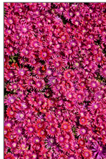
Granita Raspberry Ice Plant in bloom

Granita Raspberry Ice Plant is recommended for the following landscape applications;