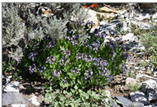
Jones' Bluestar in bloom