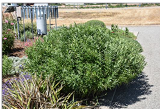
Jones' Bluestar