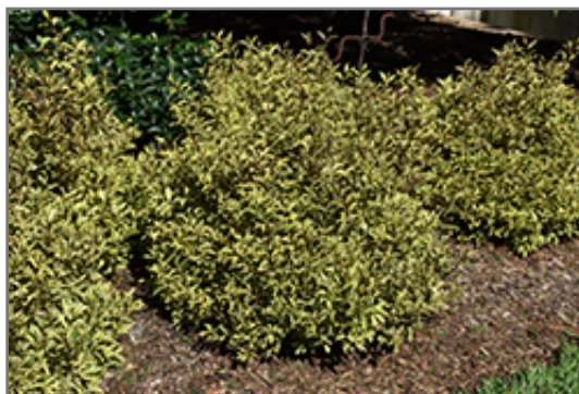
Bubbly Wine Weigela

Bubbly Wine Weigela makes a fine choice for the outdoor landscape, but it is also well-suited for use in outdoor pots and containers. It can be used either as 'filler' or as a 'thriller' in the 'spiller-thriller-filler' container combination, depending on the height and form of the other plants used in the container planting. It is even sizeable enough that it can be grown alone in a suitable container. Note that when grown in a container, it may not perform exactly as indicated on the tag - this is to be expected. Also note that when growing plants in outdoor containers and baskets, they may require more frequent waterings than they would in the yard or garden.