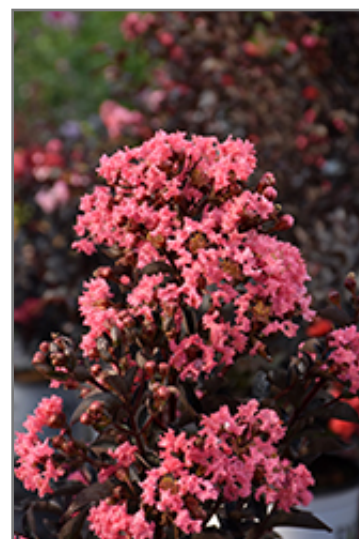
Center Stage Coral Crapemyrtle flowers