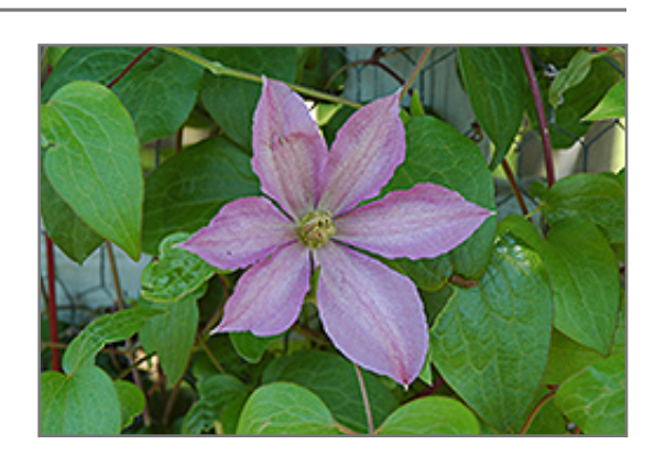
Madame Baron Veillard Clematis flowers

Madame Baron Veillard Clematis will grow to be about 10 feet tall at maturity, with a spread of 24 inches. As a climbing vine, it tends to be leggy near the base and should be underplanted with low-growing facer plants. It should be planted near a fence, trellis or other landscape structure where it can be trained to grow upwards on it, or allowed to trail off a retaining wall or slope. It grows at a medium rate, and under ideal conditions can be expected to live for approximately 20 years.