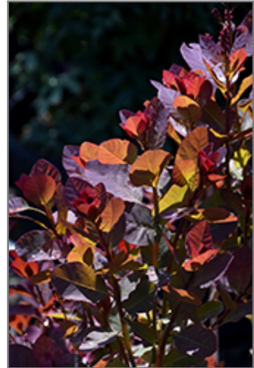
The Velvet Fog Smokebush foliage

This shrub should only be grown in full sunlight. It prefers to grow in average to moist conditions, and shouldn't be allowed to dry out. This plant will benefit from an application of bonemeal and/or mycorrhizal fertilizer at the time of planting. It is not particular as to soil type or pH. It is highly tolerant of urban pollution and will even thrive in inner city environments, and will benefit from being planted in a relatively sheltered location. This is a selected variety of a species not originally from North America.