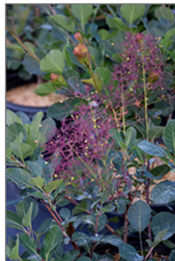
The Velvet Fog Smokebush flowers