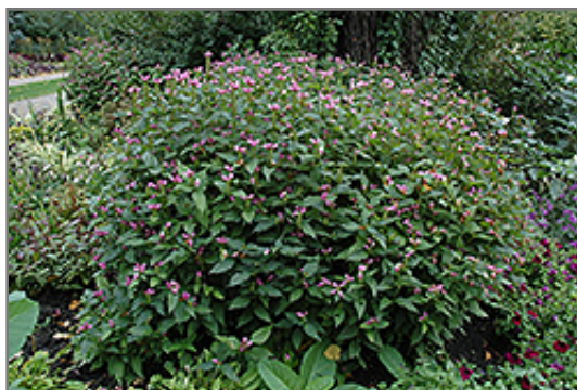
Pink Turtlehead in bloom