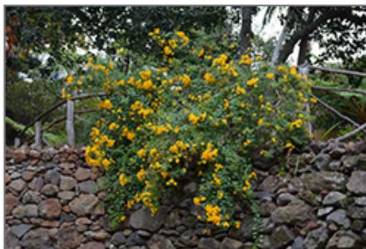
Yellow Marmalade Bush in bloom