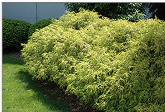
Dwarf Golden Sawara Falsecypress