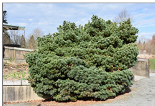
Blue Shag White Pine