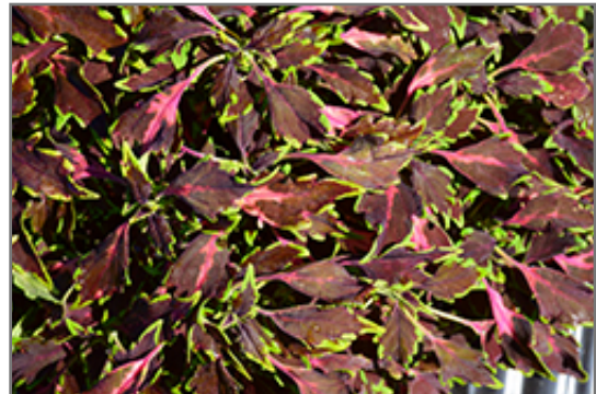
PartyTime Red Bolero Coleus foliage