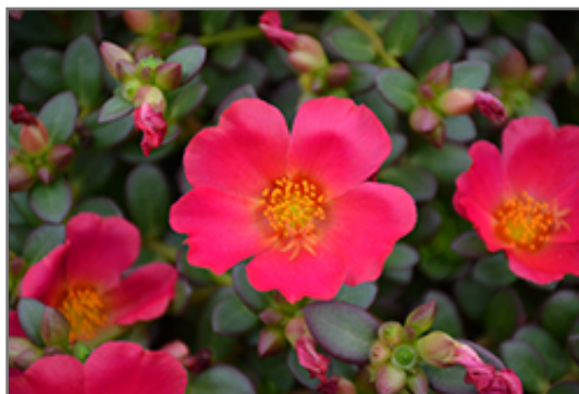
Cupcake Upright Magenta Portulaca flowers

Cupcake Upright Magenta Portulaca is recommended for the following landscape applications;