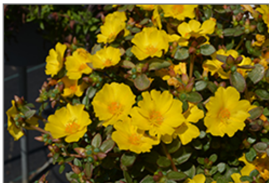
Cupcake Upright Lemon Zest Portulaca flowers

Cupcake Upright Lemon Zest Portulaca is recommended for the following landscape applications;