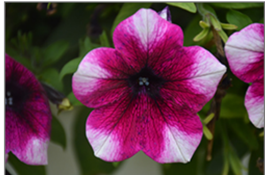
Sweetunia Purple Touch Petunia flowers