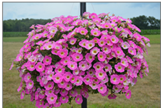
Sweetunia Pink Lemonade Petunia in bloom