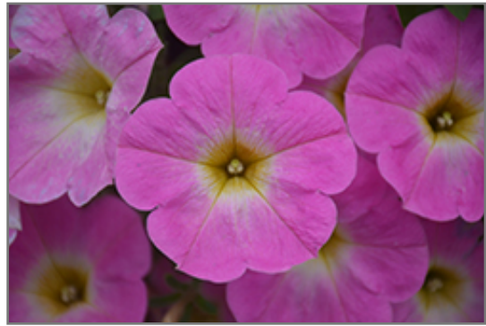
Sweetunia Pink Lemonade Petunia flowers

Sweetunia Pink Lemonade Petunia is recommended for the following landscape applications;