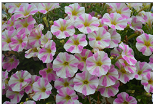
Sweetunia Light Pink Touch Petunia flowers