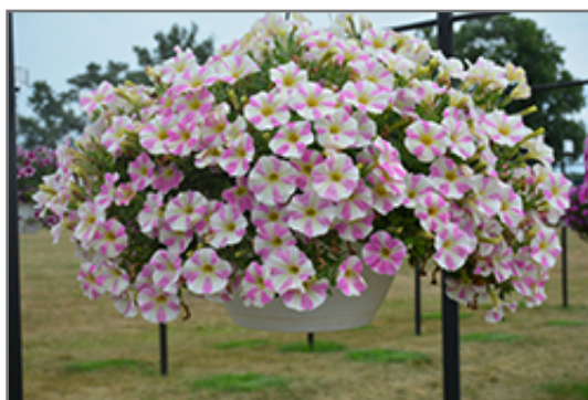
Sweetunia Light Pink Touch Petunia in bloom