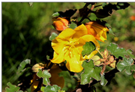
Dara's Gold Fremontodendron flowers