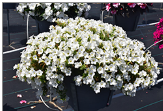
Itsy White Petunia in bloom