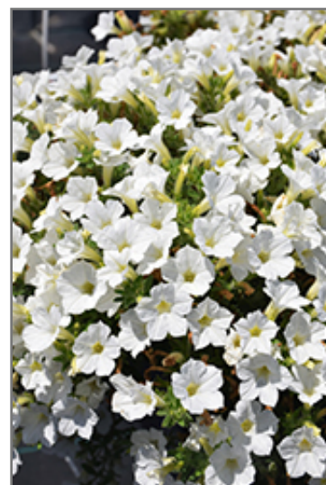
Itsy White Petunia flowers

Itsy White Petunia is recommended for the following landscape applications;