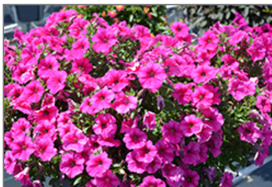
Durabloom Hot Pink Petunia in bloom