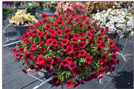
SuperCal Royal Red Petchoa in bloom