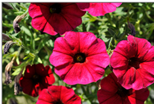
SuperCal Royal Red Petchoa flowers

SuperCal Royal Red Petchoa will grow to be about 12 inches tall at maturity, with a spread of 18 inches. When grown in masses or used as a bedding plant, individual plants should be spaced approximately 15 inches apart. Its foliage tends to remain dense right to the ground, not requiring facer plants in front. This fast-growing annual will normally live for one full growing season, needing replacement the following year.