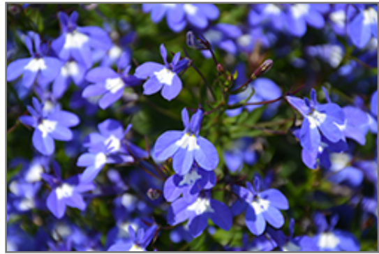
Suntory Trailing Blue with Eye Lobelia flowers