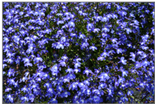
Suntory Trailing Blue with Eye Lobelia flowers