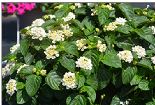
Havana Full Moon Lantana flowers

Havana Full Moon Lantana will grow to be about 18 inches tall at maturity, with a spread of 18 inches. When grown in masses or used as a bedding plant, individual plants should be spaced approximately 14 inches apart. Although it's not a true annual, this fast-growing plant can be expected to behave as an annual in our climate if left outdoors over the winter, usually needing replacement the following year. As such, gardeners should take into consideration that it will perform differently than it would in its native habitat.