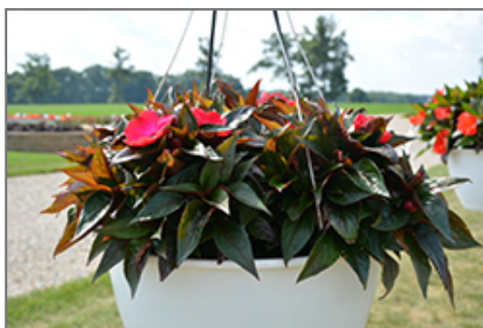
Painted Select Rose Flair New Guinea Impatiens in bloom