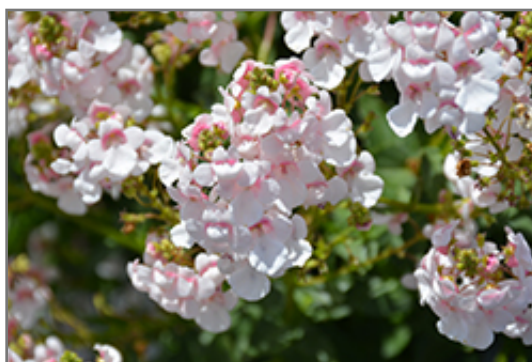
Sundiascia Upright Blush White Twinspur flowers