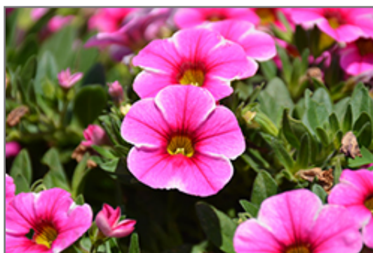
Volcano Pink Calibrachoa flowers