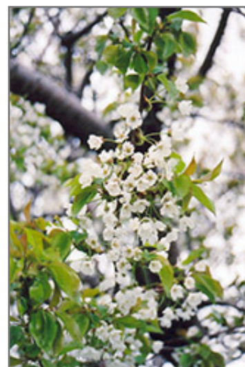
Sweet Cherry flowers

Sweet Cherry is covered in stunning clusters of fragrant white flowers hanging below the branches in early spring before the leaves. It has dark green deciduous foliage. The pointy leaves turn yellow in fall. The fruits are showy red drupes carried in abundance in mid summer. The fruit can be messy if allowed to drop on the lawn or walkways, and may require occasional clean-up. The smooth dark red bark adds an interesting dimension to the landscape.